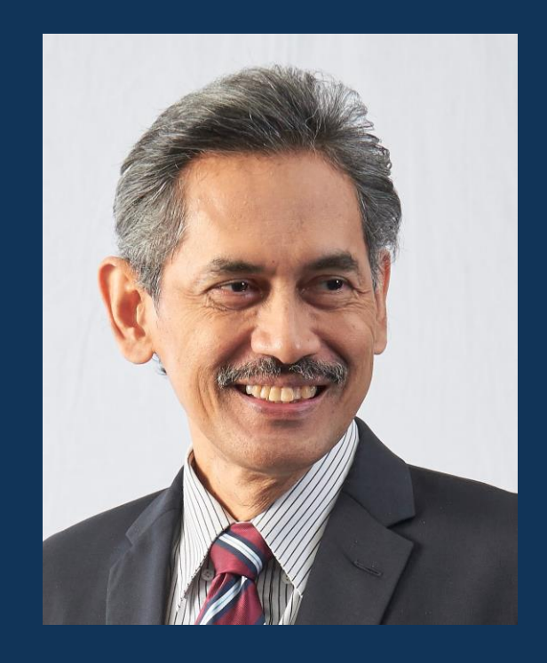
Zainal Kassim: unrivalled international authority on Takaful Insurance